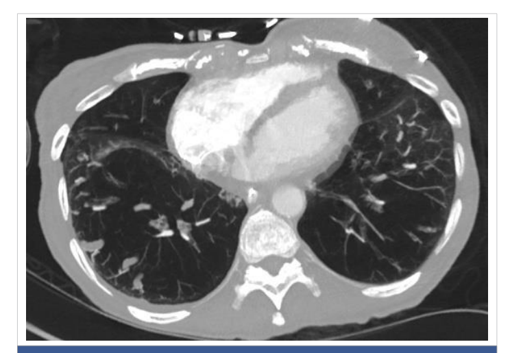
Figure 1: Computed Tomography (CT) scan of the lungs. A CT scan showed diffuse emphysema in the lower lobes of both lungs.